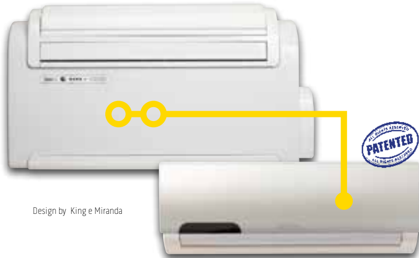
Design by King e Miranda

The system without outdoor unit to air condition two rooms at the same time. Two inside units, the traditional UNICO unit and the UNICO WALL unit, are connected by a refrigerating circuit.